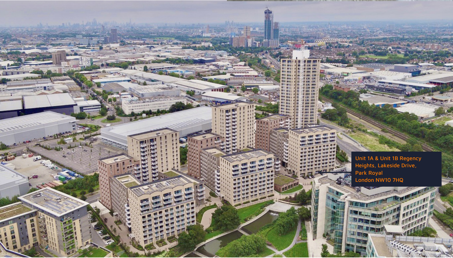
Unit 1A & Unit 1B Regency Heights, Lakeside Drive, Park Royal London NW10 7HQ